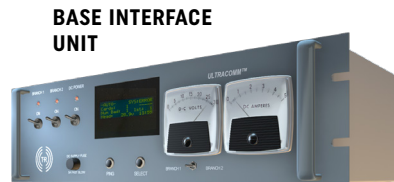
BASE INTERFACE UNIT